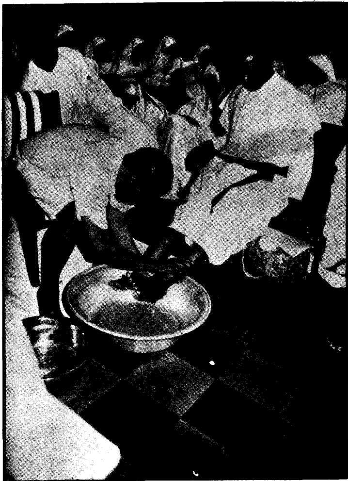
Washing Members feet