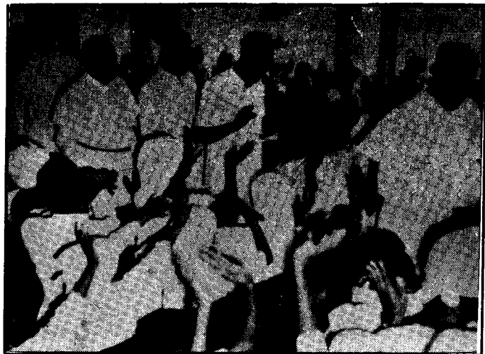
Stepping out from the altar to see people