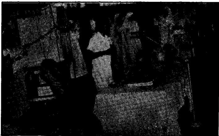
Dancing with London brethren