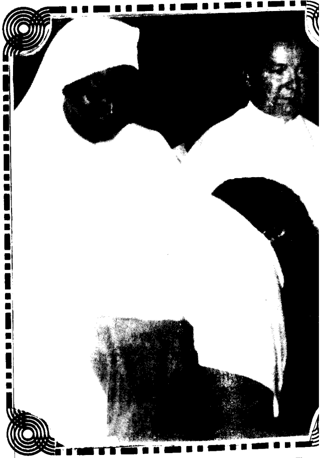
The glory of the overcomers