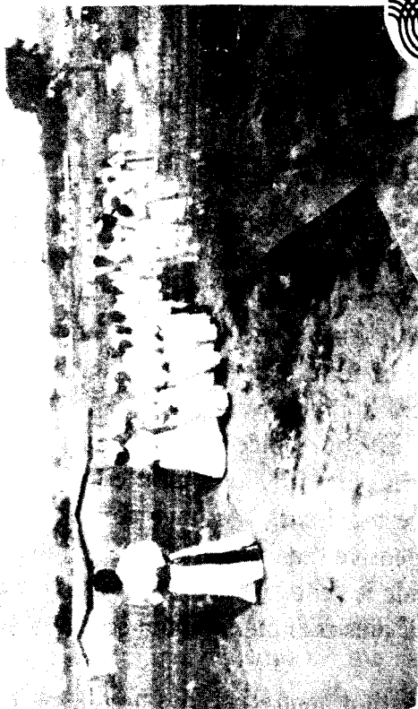
The Holy Father leading the Crusaders on liberation parade in Minar, Niger State